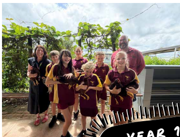
YEAR 12 CAMP